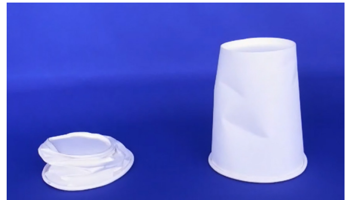
Without AI mold protection